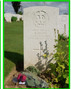
Cemetery and gravestone

After that, of course, I wanted to find out more about my grandfather and over the years I have, with the help of several WWI researchers, been able to piece together some of his life story and how a man of 41 years, father of 6 children, came to be a casualty in the Great War. I have discovered that he came from a family of shoemakers in a large village called Raunds in Northamptonshire. That a Raunds ancestor was recruited by the Mormons in 1850 and as a young man made the dangerous journey to Salt Lake City to become one of Brigham Young's right hand men. To rise in the Mormon community and to be sent out to start another city in Utah where he married and raised 18 children and became the head of a huge dynasty of descendants. Other Smiths followed but went to Buffalo City where they plied their trade as shoemakers.