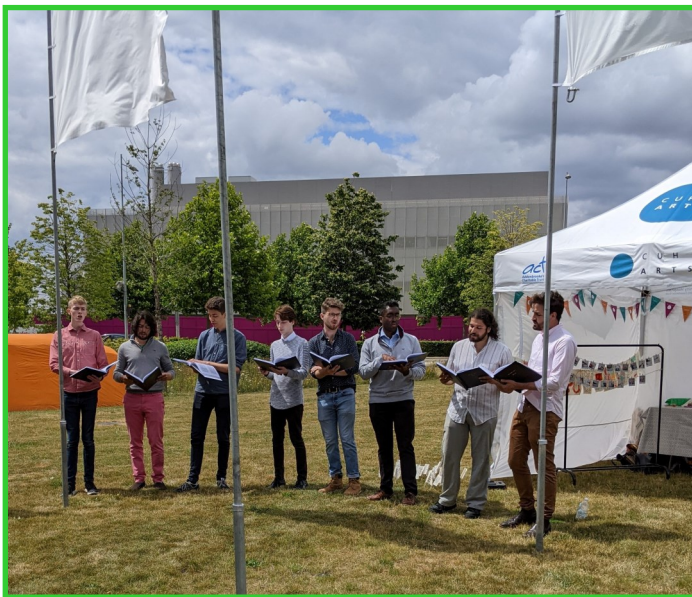
The King's Men