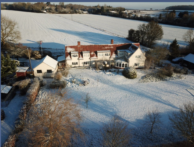
'Over the Treetops' by Charles, PAT Volunteer