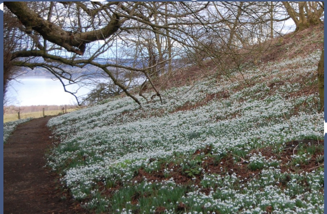
'Bank of snowdrops' by Arthur Ward Volunteer