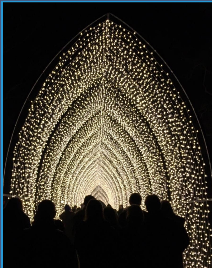
'Audley End' by Philip Gray

Judges Comments: The composition and focus is really well done to show the plants and the duck both clearly, and we feel it tells a winter story well.