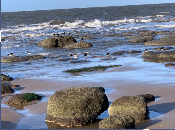
'Old Hunstanton Walk'