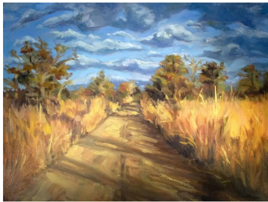
Hope Barclay's untitled landscape