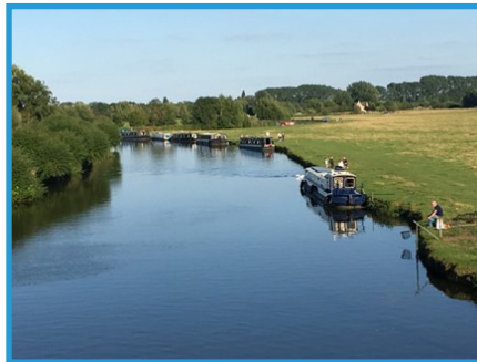
Looking at our boats from Lechlade