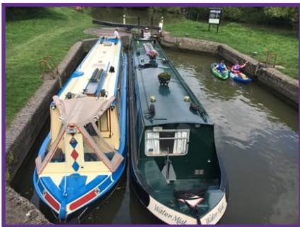
Cornmill and Watermist in Aynho Lock with a couple of canoeists we had invited in to join us