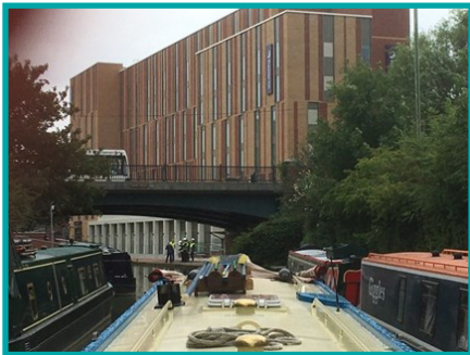
Approaching the new Premier Inn, Banbury