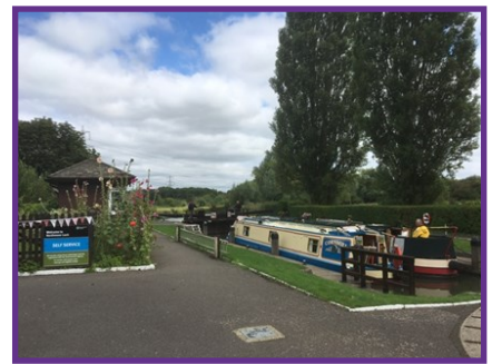
Self service through Northmoor Lock, River Thames