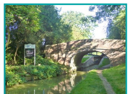
Start of the Claydon Lock Flight, Oxford Canal