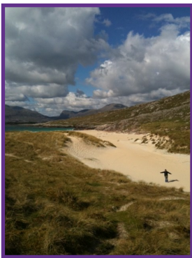
Stunning beach in North West Highlands

I've spent a couple of holidays touring around the northwest coast and the Western Isles. It was not entirely luxurious as we were camping and travelling in a very leaky old Landrover (I had to wear waterproofs inside). On more than one occasion we needed to tie our tent to the Landrover and trailer to stop it blowing away (I appreciate this isn't necessarily selling the location!). We also had the most glorious sunshine, visited wonderful white sandy beaches and had some amazing walks.