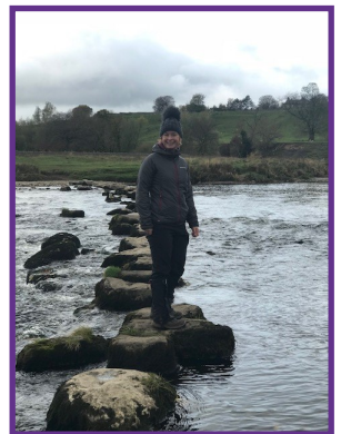
Stepping stones over the River Wharfe

I've been a regular visitor to the Yorkshire Dales since I was a young child and I absolutely love it. We always stay in the Grassington area. As a child it was at a converted water mill on the River Wharfe and more recently in the our pod caravan at a site nearby. It's the combination of hills, rivers and happy memories which keep me going back year after year.