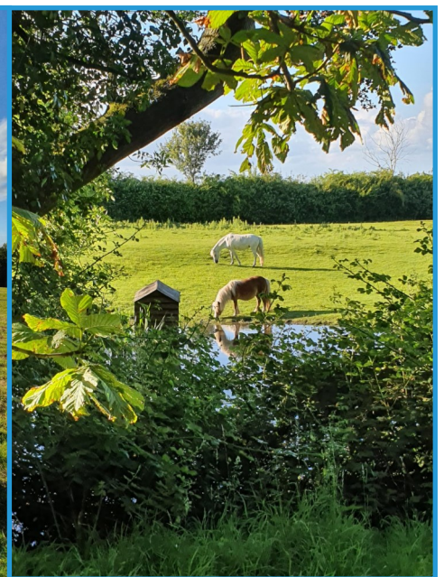
Kneppwell Nature Reserve