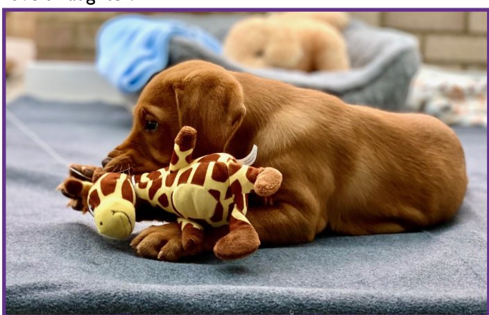
Rhudy making himself comfortable

The gaping void in our lives and home however soon became apparent & after much soul-searching, we have just acquired this adorable little boy – Rhudy. Our home is once again filled with a wagging tail, & lots of companionship, love & laughter.