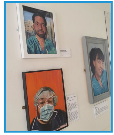
Portraits of staff