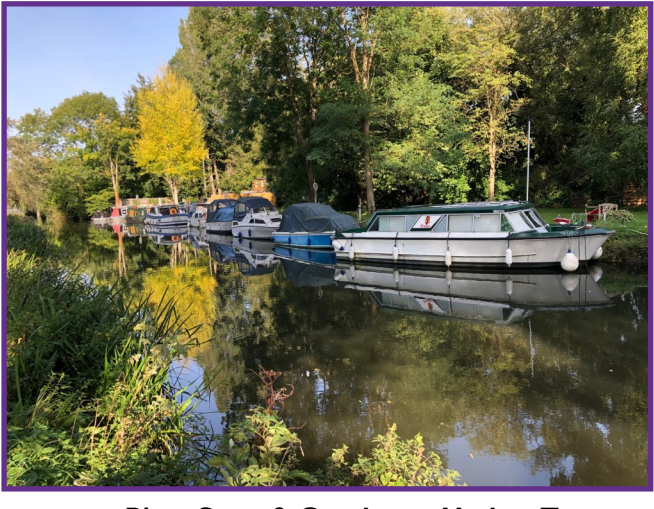
River Stort & Canal near Harlow Town, Harlow Mill, Sawbridgeworth

We continued on to Sawbridgeworth and caught the train back to Cambridge. Most people were very good on the train and wore their masks and sat safe distanced.