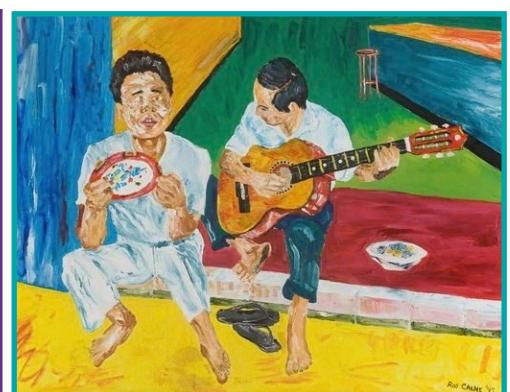
Blind Musicians in Malaysia