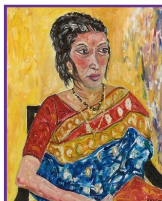
Oil painting of Sathia Thiru

Here are a few examples of some of Calne's paintings held in our collection, as well as a bronze sculpture of Calne himself, created by Laurence Broderick.