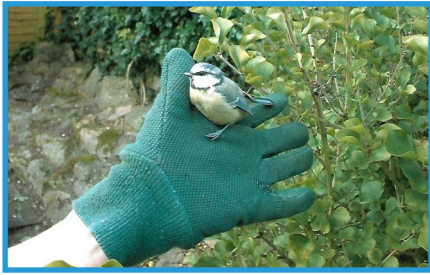
Blue tit recovering

This week Lesley shares what she and Brian have been up to. Lesley is one of our Breast Unit volunteers and Brian is a Guide at Main Reception.