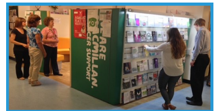
Macmillan Information Pod