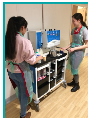
YPP volunteers serving drinks