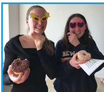
Enjoying the celebration

Thank you to all our YPP volunteers for your help.