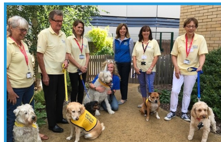
Lola, Finch, Mitzi, Mylo, Lillie and Merlin and their owners!

If you're on a ward and you think a patient may benefit from a visit, please let us know and we'll see what we can arrange. For infection control reasons, not all wards or clinics can have dogs but many can.